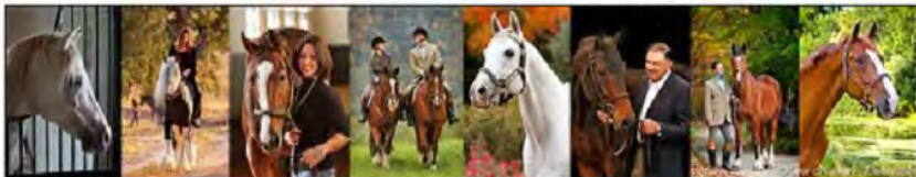
TIMELESS EQUINE IMAGES

Horses/ponies are required to trot a circle on a loose rein at the end of each over fences performance. Horses/ponies may be asked to return to the ring and trot another circle at the judge's discretion